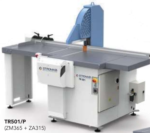
TR501/P (ZM365 + ZA315)