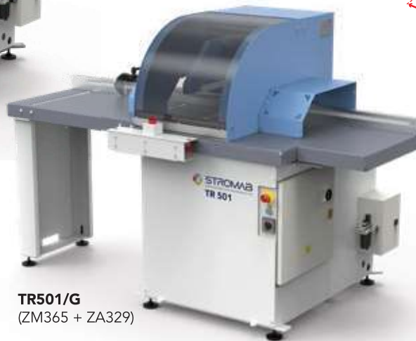
TR501/G (ZM365 + ZA329)